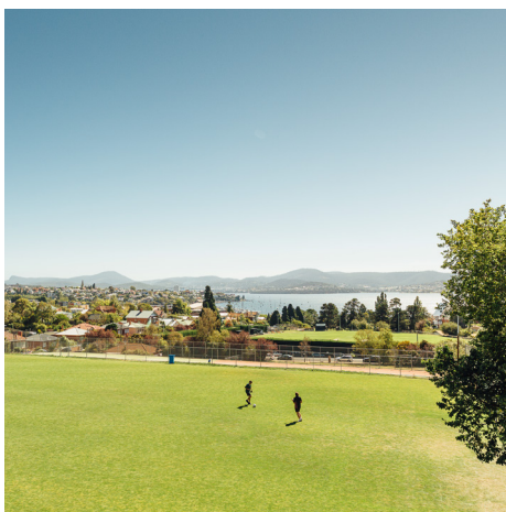
The School grounds which overlook the River Derwent.

Choosing a boys school has many advantages. At Hutchins we provide learning spaces specifically designed for teaching boys, this includes providing resources and designing programs that meet their educational and developmental needs. We employ teachers who are passionate about teaching and who receive continuous professional development in best practice, innovative and creative learning.